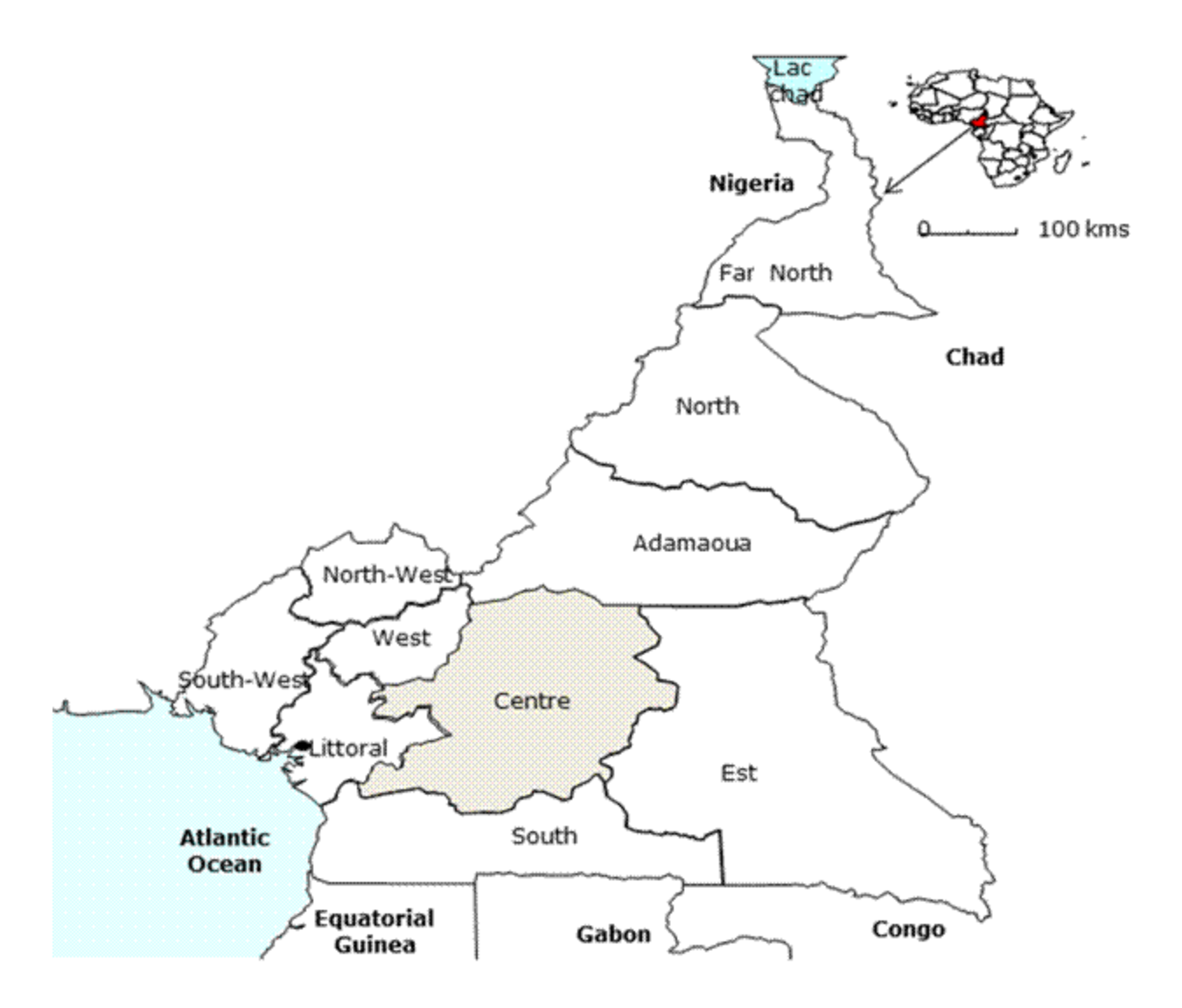
Fig. 1. Location of the Centre Region in Cameroon