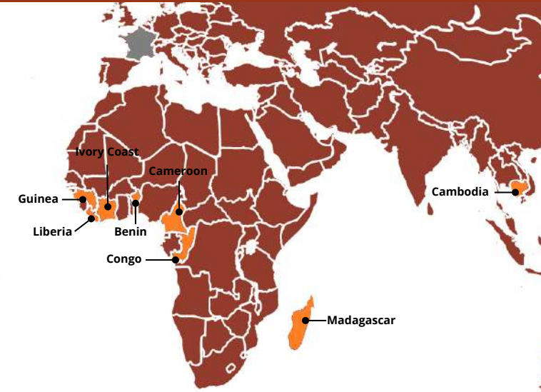
Evolution of the budget in K€ by country of intervention