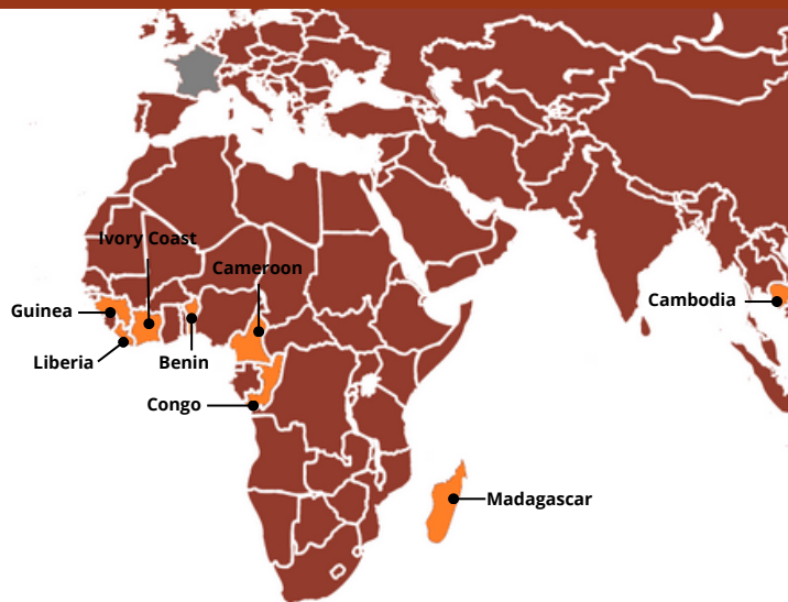
Evolution of the budget in K€ by country of intervention