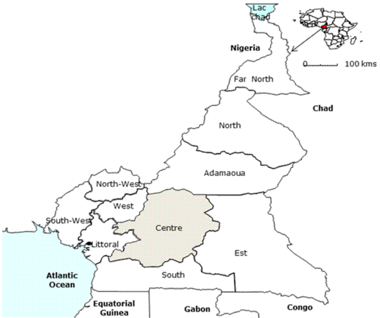
Fig. 1. Location of the Centre Region in Cameroon